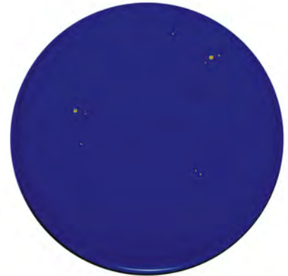
With Microban® Protection